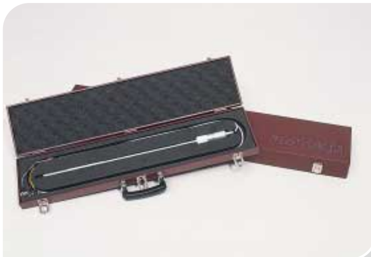
Standard Platinum Resistance Thermometer

In default of information you will be supplied with a 670/25.5 without calibration