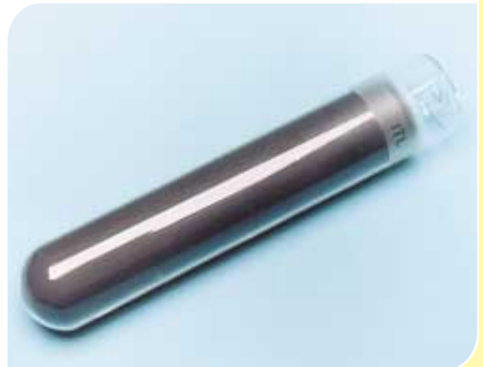
A Slim Fixed Point Cell